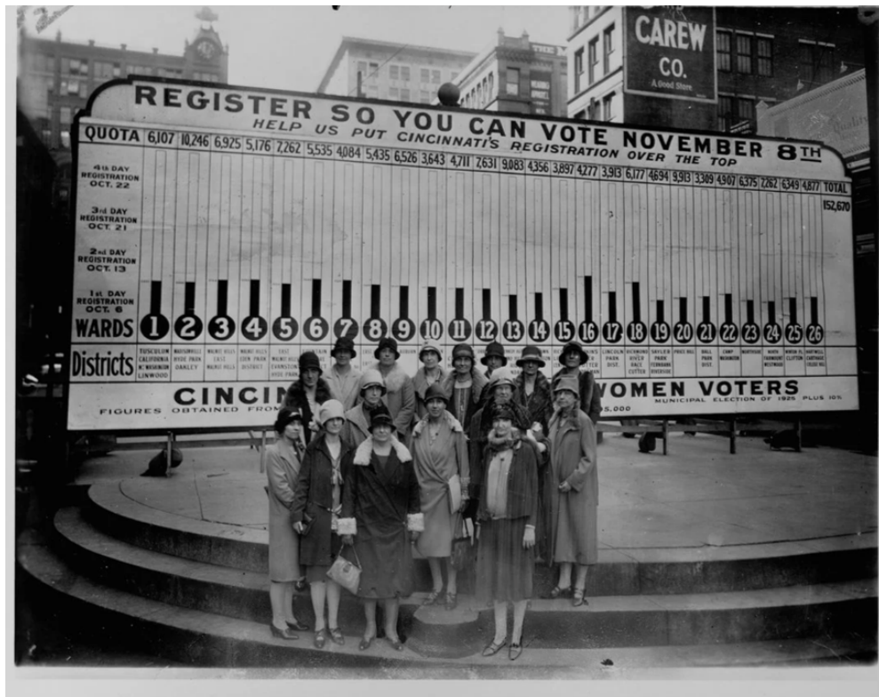
A group from the Cincinnati chapter of the League of Women Voters stands in front of a board showing voter registration by city ward.

In sum, voter registration drives, especially for the suffragists, had become part of the social fabric of many places, as seen through this voter registration tally board in downtown Cincinnati 73 :